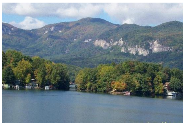
Lake Lure, NC