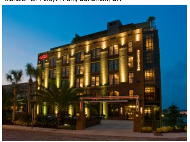
The Bohemian Hotel, Savannah Riverfront

Discounts on stays at The Bohemian Hotel can be reserved by calling 877.486.9575 or visiting their website at <a href="https://www.bohemianhotelsavannah.com">www.bohemianhotelsavannah.com</a>. If visiting the website, select Company and enter BMW for the Code in the Rates & Packages field to obtain the discount.