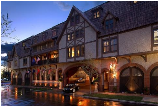
Grand Bohemian Hotel -Asheville

When making your reservations, mention or enter BMW10 for a 10% discount. <u>Click here</u> to visit their website.