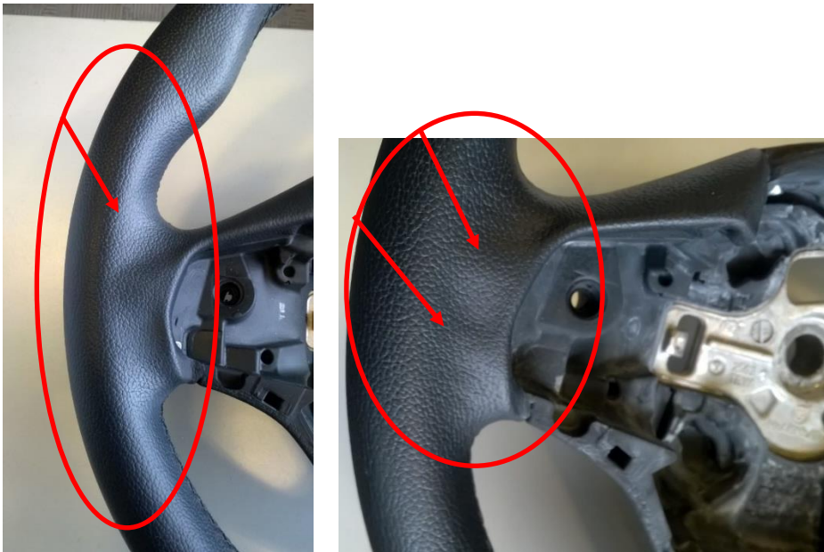
Not OK example - Leather steering wheel (base version) – blistering visible at the steering wheel clasp → covered by warranty