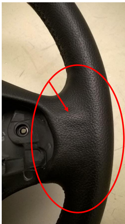
Not OK example - Leather steering wheel (base version) – blistering visible at the steering wheel clasp → covered by warranty