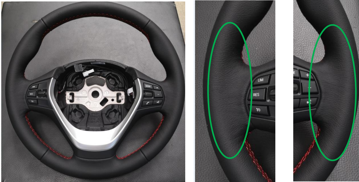
OK example - Leather steering wheel (sport version)