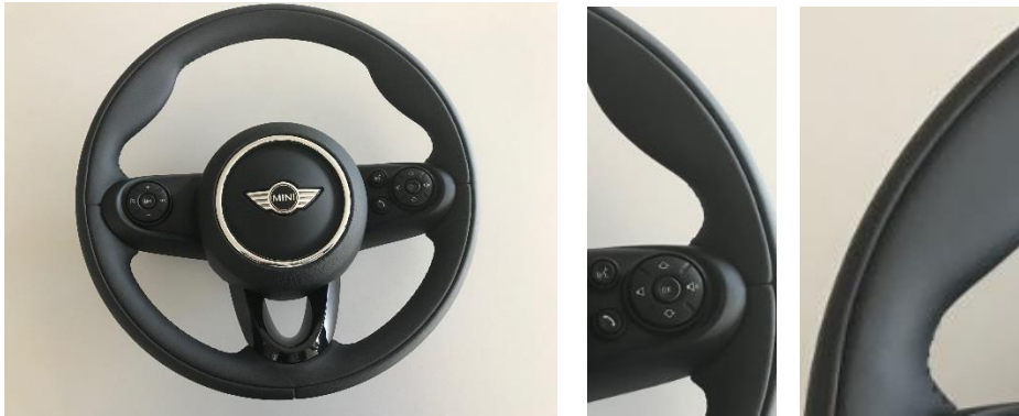
OK example Leather steering wheel – Surface