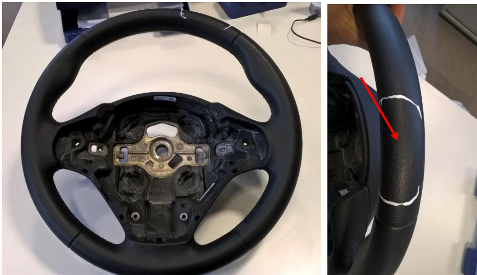
Not Ok example - surface peeling → covered by warranty